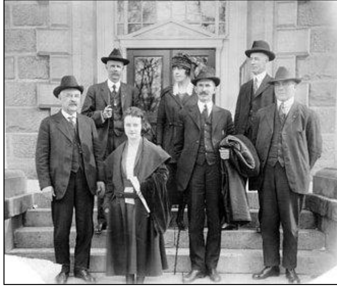
Elko County Delegation, 1921. -- 1921. 1 photograph b&w 25.5x20cm.