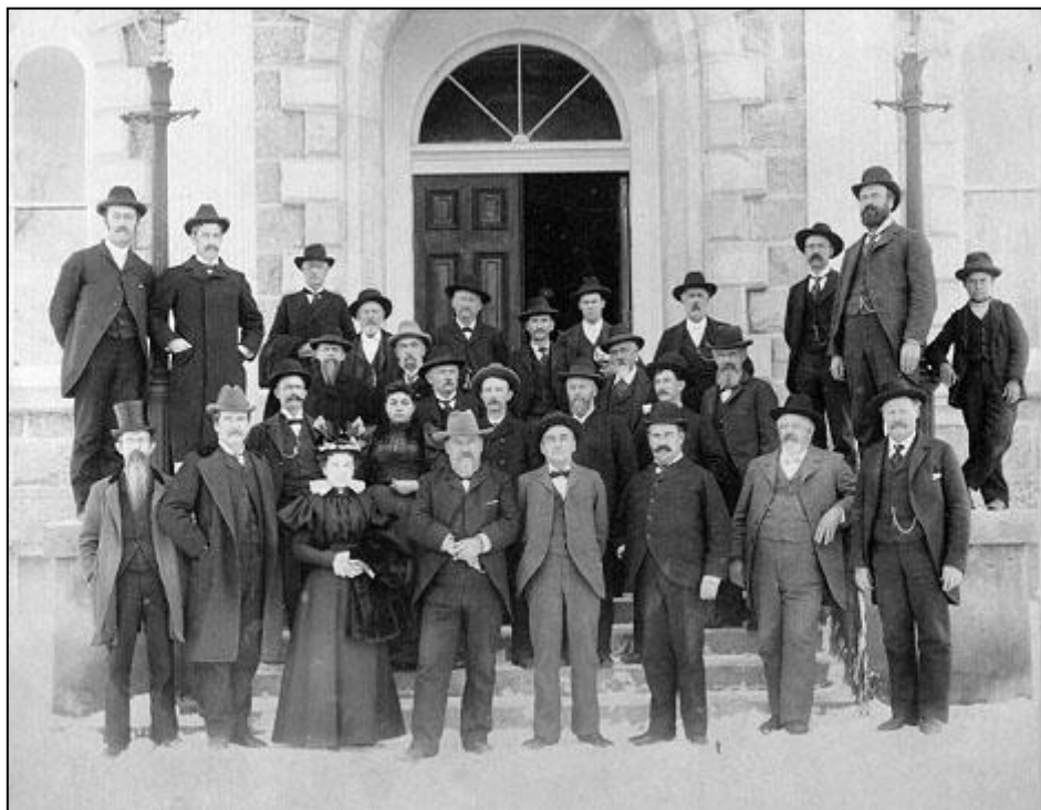
Nevada State Senate, 1897 – 1897 1 photograph b&w 24x19cm

Summary: Photograph of the 1897 Nevada State Senate standing in front of the Nevada State Capitol building, Carson City, NV.