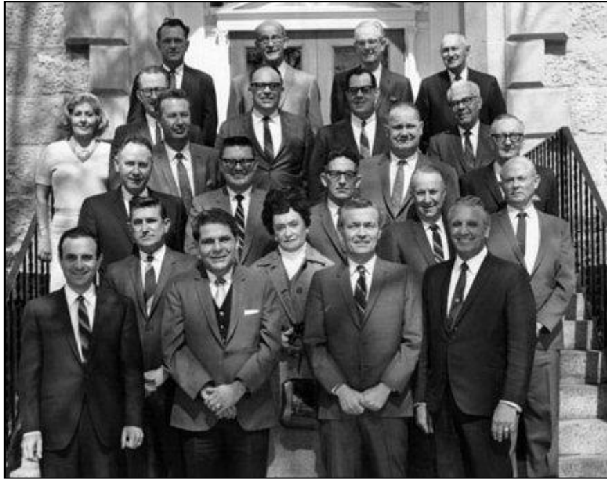
Nevada State Senate, 1969 -- 1969 1 photograph b&w 23.5x18.5cm

Summary: Photograph of the 1969 Nevada State Senate standing on the steps of State Capitol building, Carson City, NV.