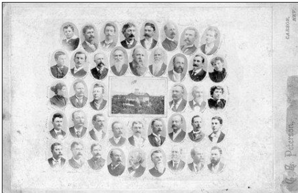
Nevada State Assembly, 1895 1 photograph b&2 10.5x16cm

Summary: Carte de visite portrait of Nevada State Assembly, 1895. State Capitol Building pictured in center of card.